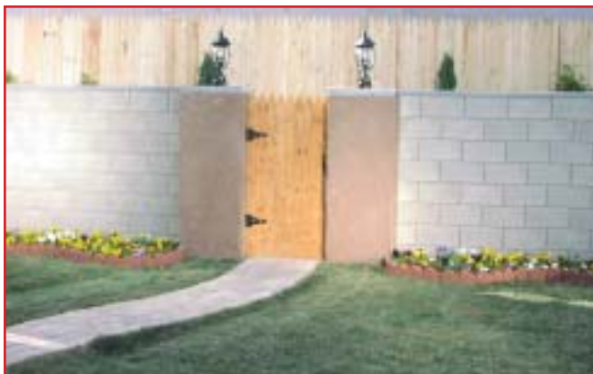
Figure 3 - A Mortarless Garden Wall Application

In-plane shear strength of surface-bonded walls is attributable to friction developed along the bed joints resulting from vertical compressive stress in addition to the diagonal tension strength of the fiber coating. If the enhancement in shear strength given by the fiber reinforced surface parging is equal to or greater than that provided by the mortar-unit bond in conventional masonry construction, then allowable shear strength values per the MSJC code (ref. 1) may be used. In such case, section properties used in Equation 3 should be based on the cross-section of the face shells.