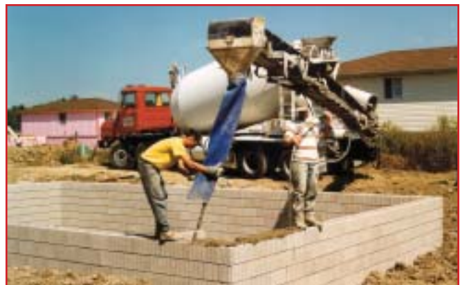
Figure 4 - A Residential, Mortarless, Single-Family Basement - Part of a 520 Home Development