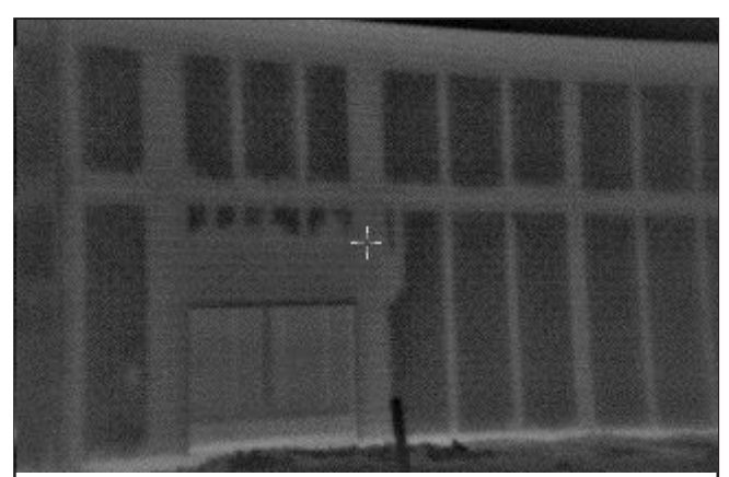
Figure 3—Infrared Photograph Used to Verify Proper Grout Placement

Borescopes (rigid optical scope) and fiberscopes (flexible optical scope) are useful for viewing interior void areas in a masonry wall. The scope is inserted into a small hole drilled into the wall, and can be attached to a camera or video recorder to document the observations. Borescopes and fiberscopes are often used to visually confirm anomalies detected using ultrasound, impact-echo or infrared methods, or to assess the condition of interior objects or cavities such as wall ties and collar joints.